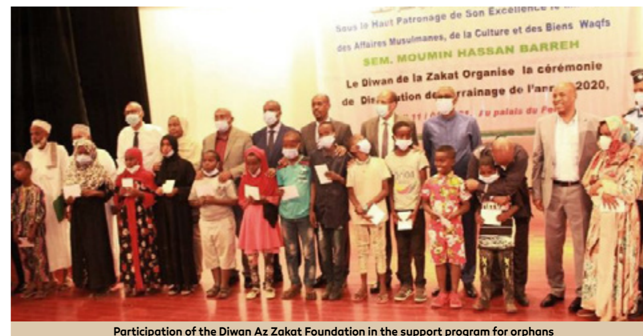
Participation of the Diwan Az Zakat Foundation in the support program for orphans