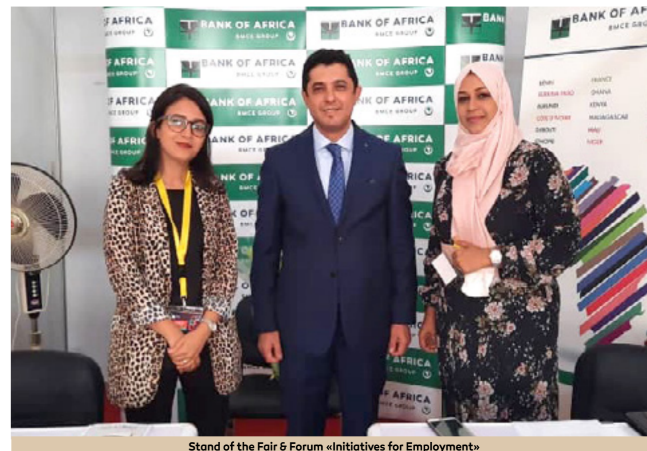
Stand of the Fair & Forum «Initiatives for Employment»